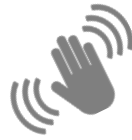
(Infra Red Sensor)

Exceptional Capacity Plus Contactless Dispensing To Avoid Hand To Tap Contamination & KLARAN UVC LED Water Purification System