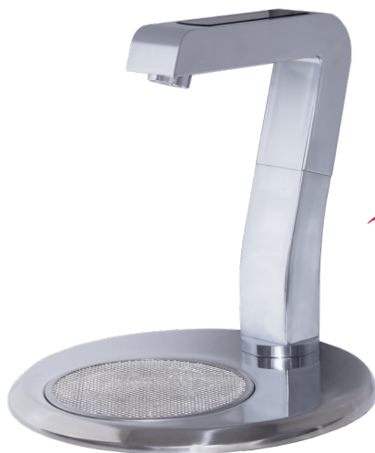
Installed with EZYTRAY 2

The EZYTAP85/8800 is a powerful Boiler, which Saves your customer Money and is Green in the process.