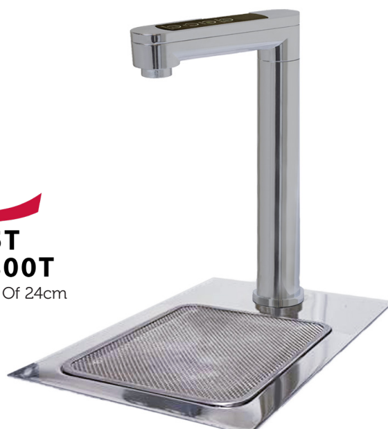
Installed with EZYTRAY 3