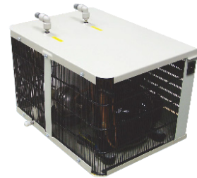
UC800M Undersink Chiller