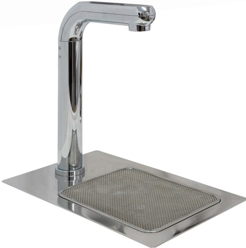
(Pictured with EZYTRAY 3)